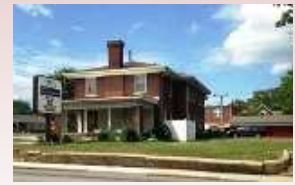
510 S Willow Street $247,500