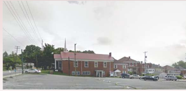
1001 & 1019 McCallie Ave $1,500,000