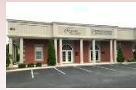
1618 Gunbarrel Road $341,500