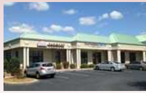
7151 & 7161 Lee Hwy $2,000,000