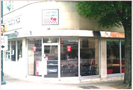
701 Cherry Street $775,000