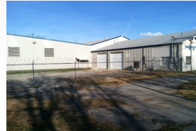
2001 Crutchfield $500,000