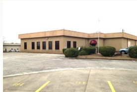
6191 Bonny Oaks $585,000