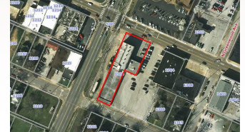
1300 McCallie $540,000 (Lease)